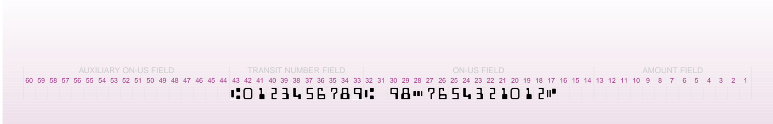
Bottom Edge of Document